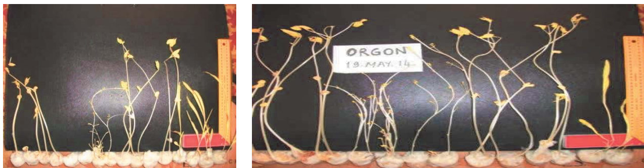
Figure 3. Plant lengths in the control and orgone box were measured as 26 cm and 37 cm, respectively.