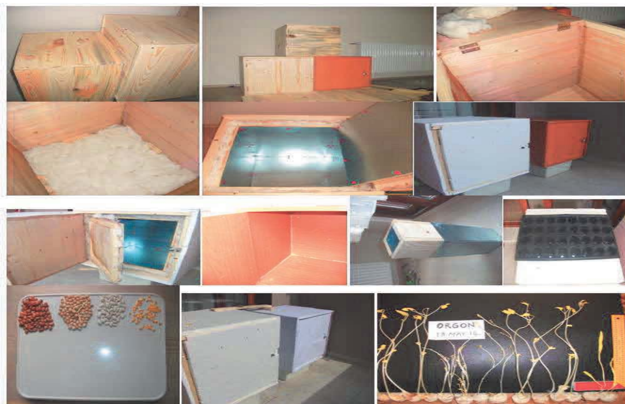
Figure 2. Construction stages of the Orgone accumulator and photographs of the test setup.

In the section on orgone of this study, we designed a 50x50x50 cm orgone energy collector and made two control boxes of the same size. The first control box was made of wood and the second was made of wood, but in the form of a Faraday cage to eliminate EM radiation. After heat and light insulation, we placed temperature, humidity sensors in all three boxes. We recorded instant measurements for 2 weeks (Fig. 2).